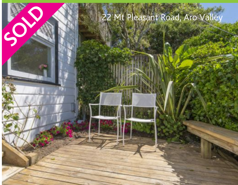
22 Mt Pleasant Road, Aro Valley

This gorgeous little Aro Valley house has just sold, and many buyers were sad to miss out! I am in the Valley every Friday morning, if you would like to get advice on how to add value to your home, feel free to call anytime.