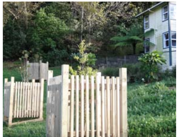
Above: Tawa, hinau and northern rata recently planted in Aro Park