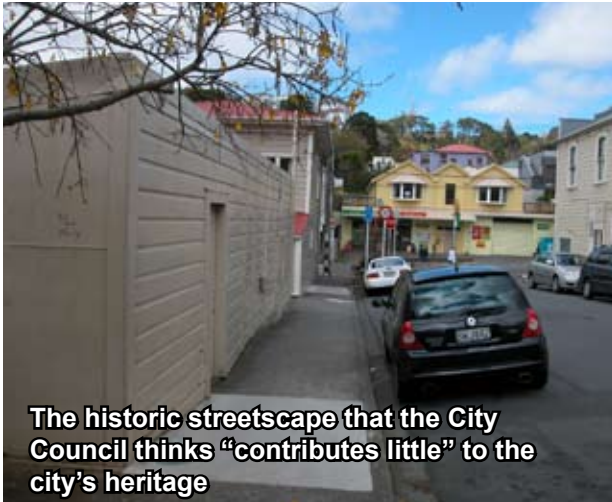
The historic streetscape that the City Council thinks “contributes little” to the city’s heritage