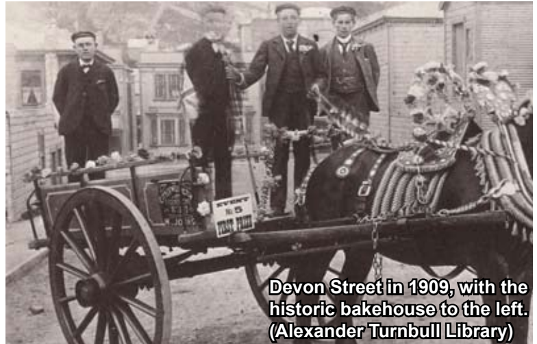
Devon Street in 1909, with the historic bakehouse to the left.

A development that will replace a 115-year-old bakehouse with two new townhouses behind the Aro Street shops has been approved, despite being inside a special heritage area and serious concerns from locals.