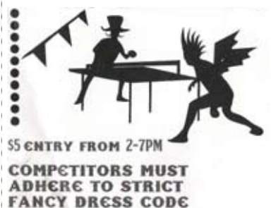
TABLE TENNIS CHAMPIONSHIP 2014 THE ARO VALLEY OPEN 1ST NOVEMBER