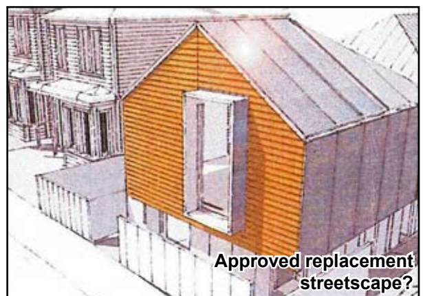
Approved replacement streetscape?

TABLE TENNIS CHAMPIONSHIP 2014 THE ARO VALLEY OPEN 1ST NOVEMBER