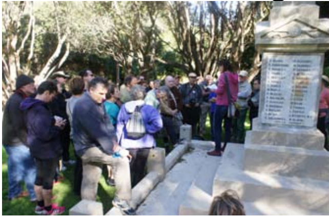
Left: The WWI history walk on Sunday 10 May ended at the Mitchelltown memorial

World War I was a deeply unnecessary war that New Zealand should never have got involved in, and which caused untold suffering and repression of basic liberties, locals heard at a conference following Anzac day, on the weekend 9-10 May.