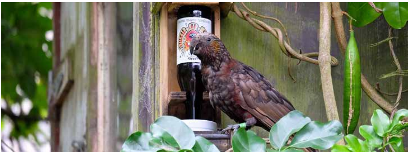
A kaka apparently enjoying some of the Aro Valley's finest in the bush next door to Te Aro School.